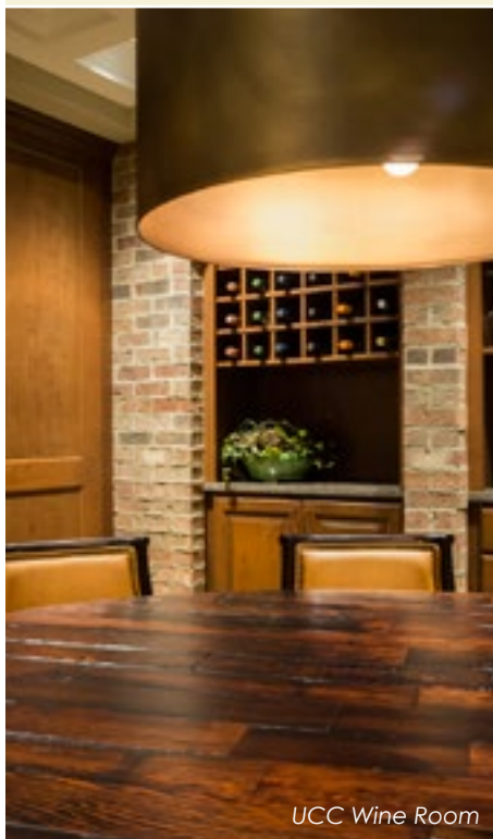
UCC Wine Room