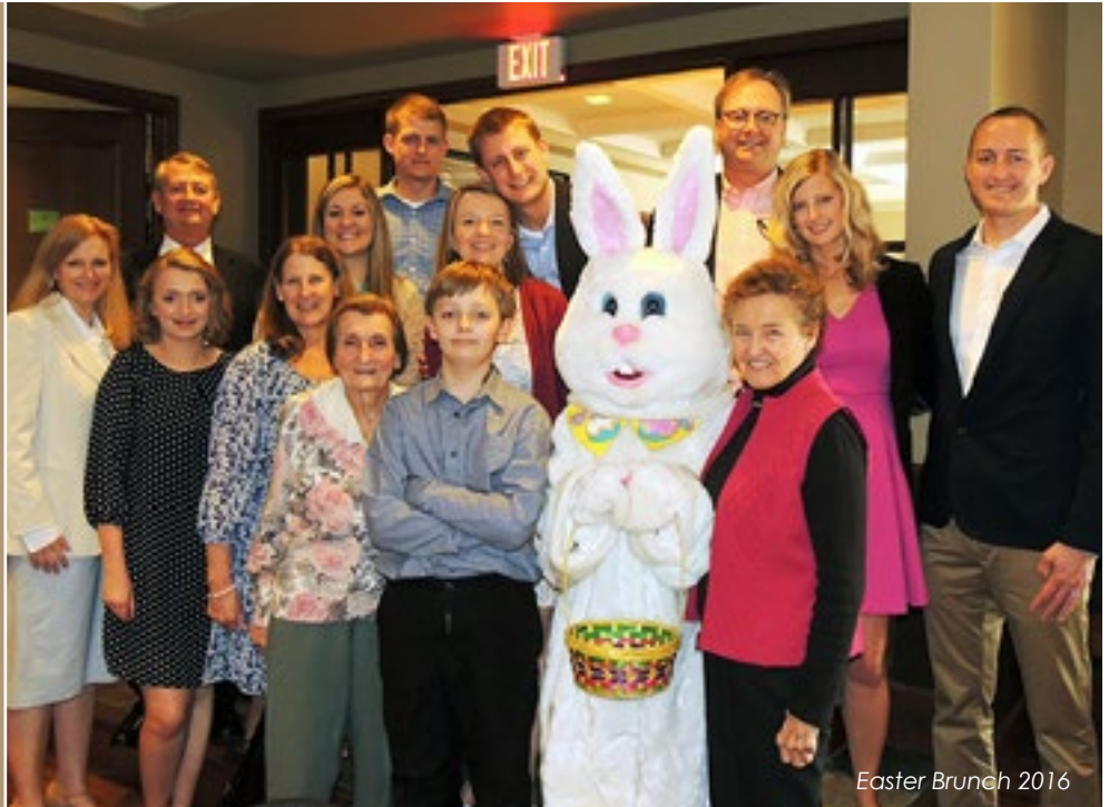
Easter Brunch 2016