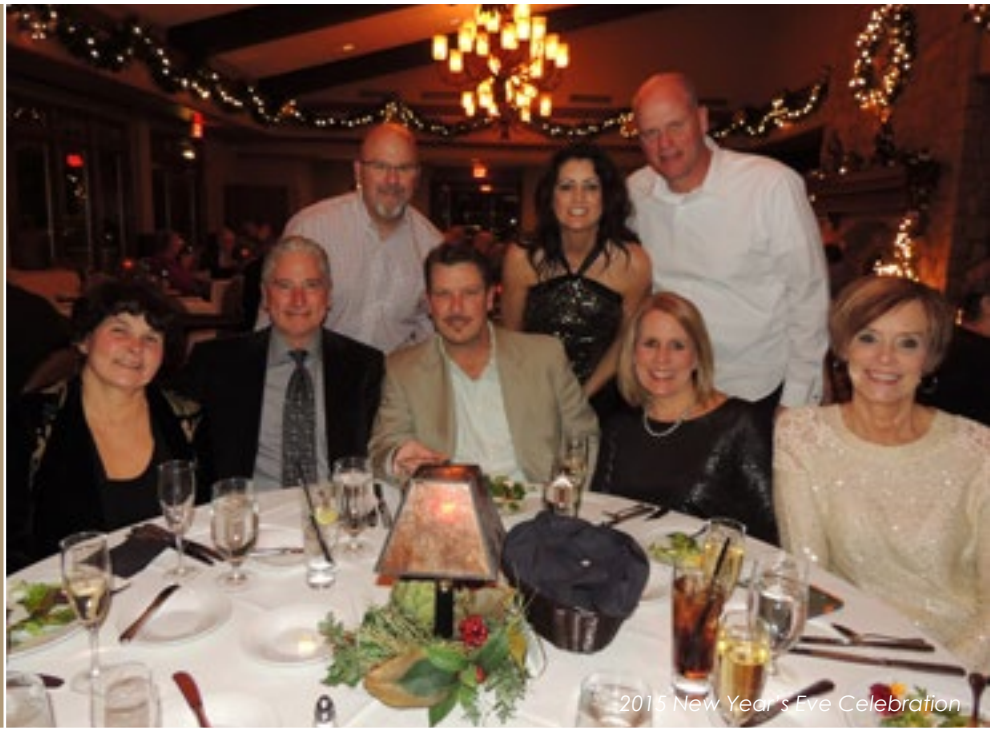
2015 New Year's Eve Celebration