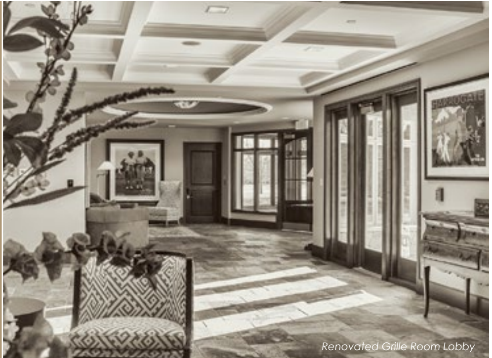
Renovated Grille Room Lobby