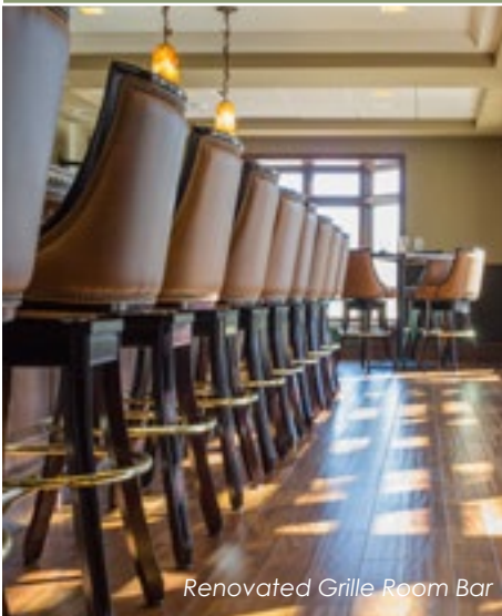
Renovated Grille Room Bar